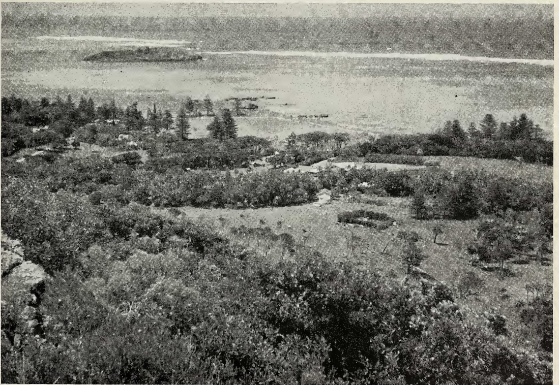
FIG. 4. Inhabitated area of the island, "The Old Settlement." Large trees are araucarias, introduced from Norfolk Island. In mid-photo are the dominating Howea palms. A line of surf marks the boundary of the coral reef. Rabbit Island in background.

A noticeable feature of the coral rock is the stratification in layers; most of the layers are inclined at an angle of about 30 degrees. This lifting was thought to be caused by earth